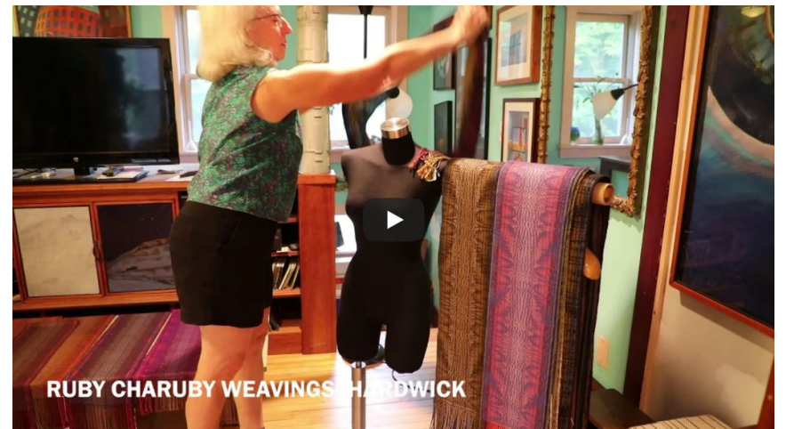
Ruby Charuby Weavings, Hardwick [video link]