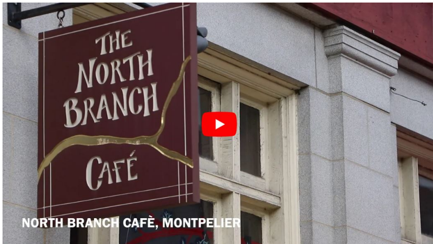
North Branch Café, Montpelier [video link]

Business owners from around the state have been supportive of the program, offering testimonials of their experience. Since the launch of the program, over 500 additional businesses have expressed support in being active participants should the program be funded to continue.